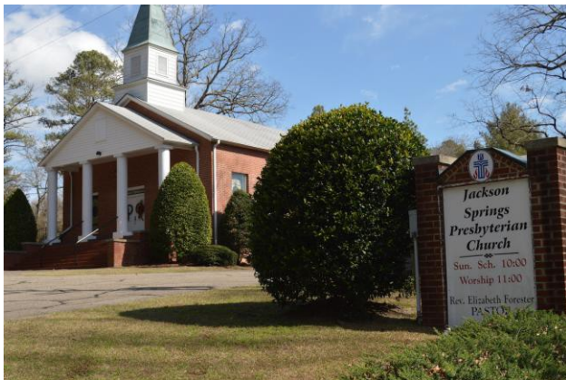
Jackson Springs Presbyterian Church