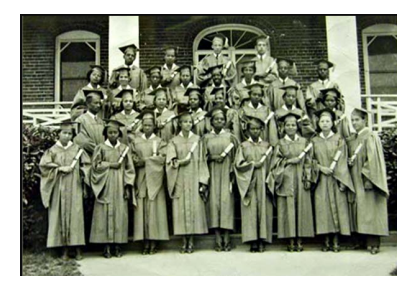
Graduation at the Henderson Institute

Henderson (now Cotton Memorial). The Institute was successful, very evolving into an excellent though segregated high school. In 1970 it was closed because of integration.